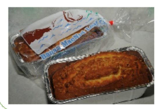
Vienna Cinnamon Bread 1 lb 2 oz.